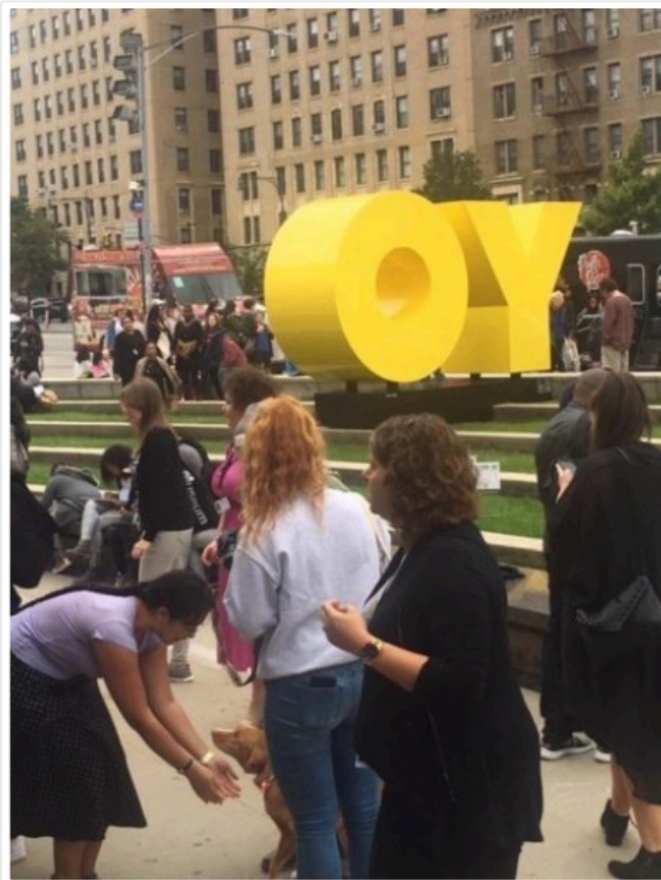
YO/OY SCULPTURE AT BROOKLYN MUSEUM

DB: Do you think this moment now where we're having a real reckoning with how we treat women in society-people always think that something good is going to come of it and sometimes it doesn't happen that way. Or it takes years or decades or centuries. Do you think something good is going to happen out of this, hopefully? How do you relate that also to the art world?