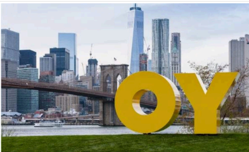
OY/YO INSTALLED IN DUMBO, © 2018 DEBORAH KASS / ARTISTS RIGHTS SOCIETY (ARS), NEW YORK

DB: Brooklyn. Is there something about Brooklyn that if this sculpture has— Brooklyn and the sculpture have an affinity for each other?