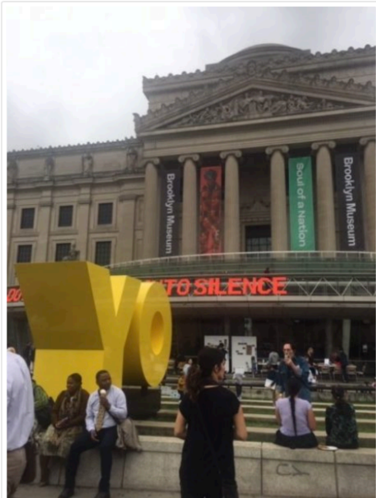
YO/OY SCULPTURE AT BROOKLYN MUSEUM

DB: Yes, the whole this Kavanaugh thing really brought a lot of very ugly stuff right to the top.